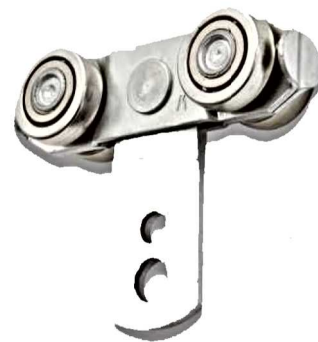
Ref. HR 101 galvanized steel Trolley